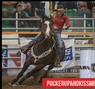
PUCKER UP AND KISS ME

$564,146 LTE, 1st- Golden State Million Futurity—G1.