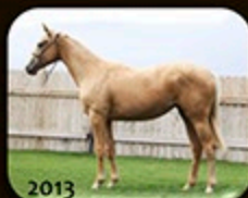
2013 NO SHAME TA KICK