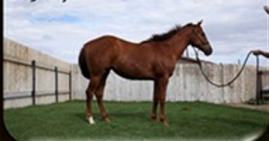
Buggin DA FROST