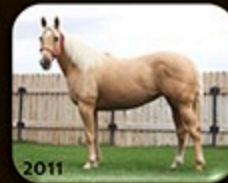
2011 SNOOPS KICK IT LETA

Watch for 'Snoops Sara Bug' at the 2016 futures and 'No Shame Ta Kick' at the barrel futures in 2018!