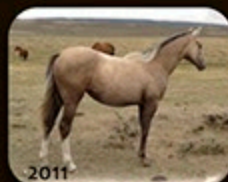
2011 SNOOPS SARA BUG

~AQHA Performance ROM Superior In Heading and Heeling ~AQHA Points in Calf Roping and Performance Halter