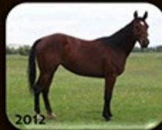
2012 SNOOPS LOONEY TUNES