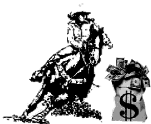
SOUTHWEST DESERT CLASSIC