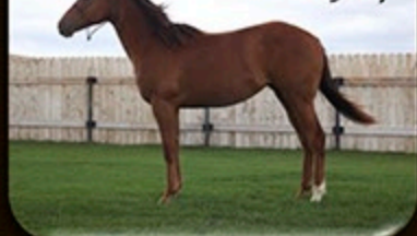
DA FAMOUS FRECKLE