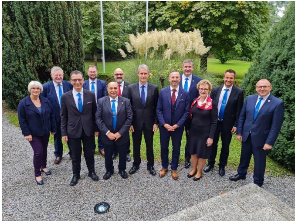
Reception at the Ministry for Security, Institutions and Sports in Sion