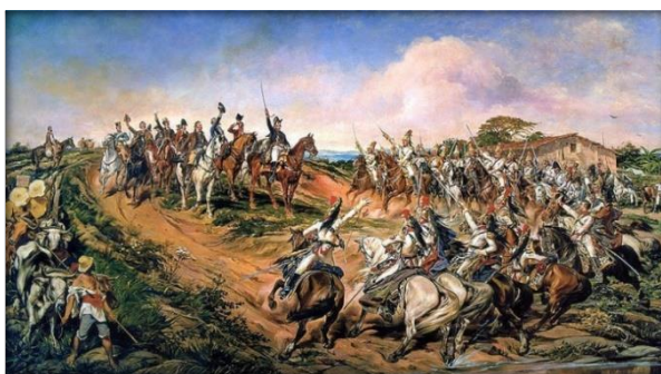
Painting: P. Américo (1888) – “O Grito do Ipiranga”