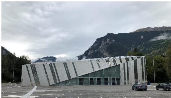
The IEB coordinating the virtual IPA IEC 2021 meeting from the congress centre in le Châble