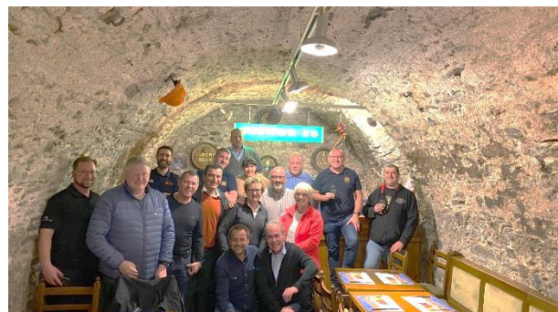
The IEB enjoying a raclette evening, kindly hosted by the IPA Valais regional board