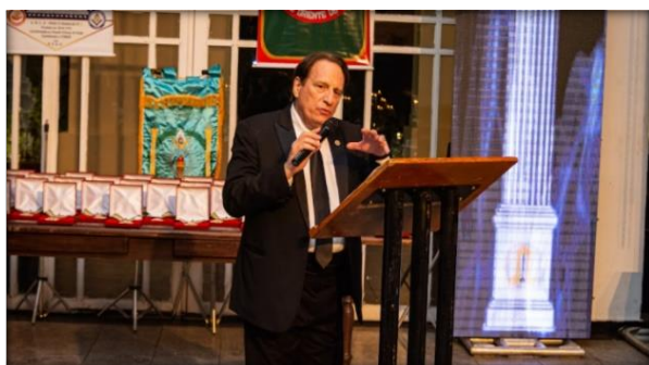
President of IPA Brazil during his thank-you speech

However, on 7 September of that year, when the Regent Dom Pedro, a Grand Master Freemason, was travelling to communicate this feat in the city of São Paulo, he was questioned by the Imperial Post on the banks of the Ipiranga stream, with a letter from his adviser, the Freemason Bonifácio, who informed him of Portugal's actions against him. Dom Pedro mounted his horse, drew his sword, and uttered the famous cry of “Independence or Death”, and took Brazil from the Portuguese yoke.